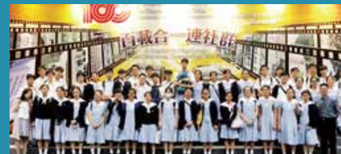
Christian Fellowship 團契