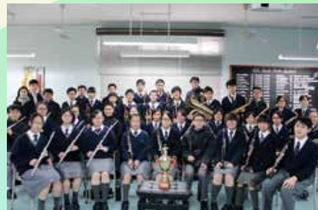
Band Contest 樂團比賽