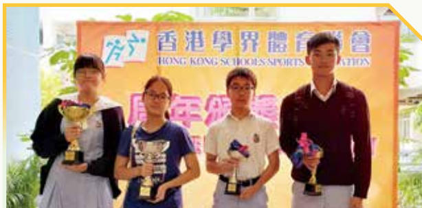
Our school representatives attended the HKSSF Annual Prize Ceremony on 26 th June, 2019. They won trophies in badminton, table tennis and volleyball competitions. 2019年6月26日，本校代表出席香港學界體育聯會周年頒獎禮，並獲得羽毛球、乒乓球及排球比賽獎盃。

本校重視擴闊學生的視野及學習經驗，除傳統體育課程外，亦鼓勵學生參與不同的體育比賽及活動。