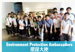
Environment Protection Ambassadors 環保大使