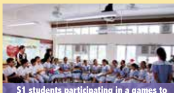
S1 students participating in a games to know each other better. 中一同學參加互相認識遊戲。