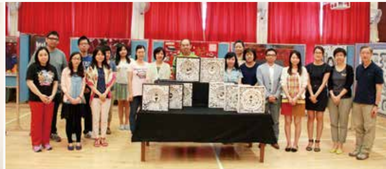
Teachers from 26 schools of Catholic Diocese of Hong Kong paid a visit to CCKYC. 26 位來自天主教香港教區中學老師到訪本校。