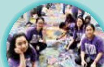
Visual Arts Ambassadors 視藝大使