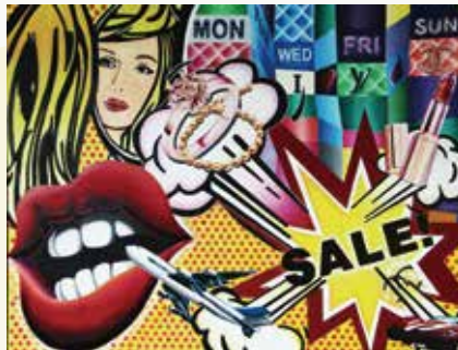
<Li Ling Fung 李聆風>