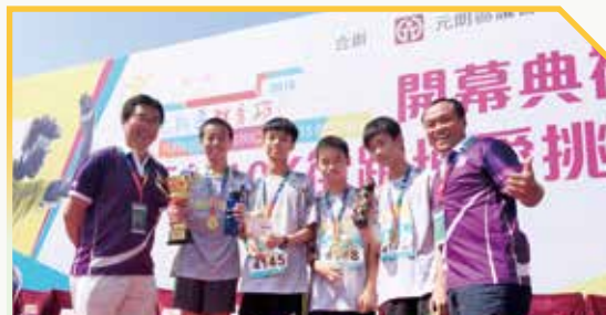
Our Long Run Club members won the championship in the 4K Team Race, aged from 9-14, Yuen Long 10K Street Running Pok Oi Challenge for the Yuen Long District Sports Festival 2016. 長跑學會成員於「元朗區體育節 2016 元朗 10K 街跑—博愛挑戰賽」4K 組別中獲得冠軍。