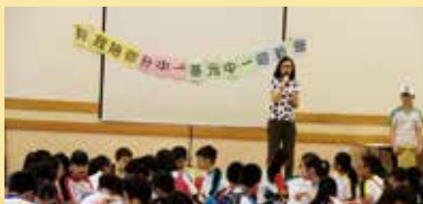
S1 students participating in team building activities. 中一同學參加團隊建立活動。