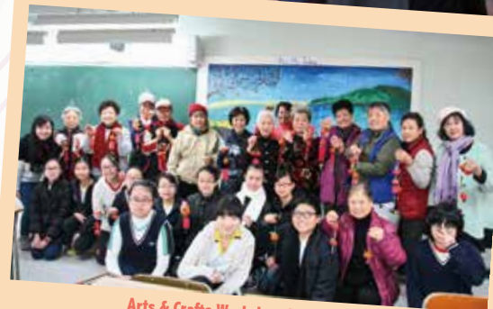
Arts & Crafts Workshop for the elderly 長者學苑手工藝班