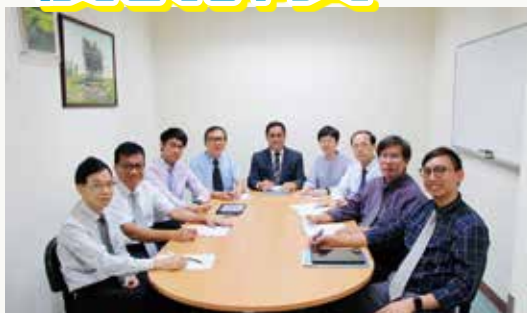
Administrative Committee of the School 校政委員會