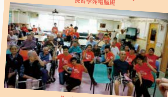
Nursing Home Visits 探訪老人院