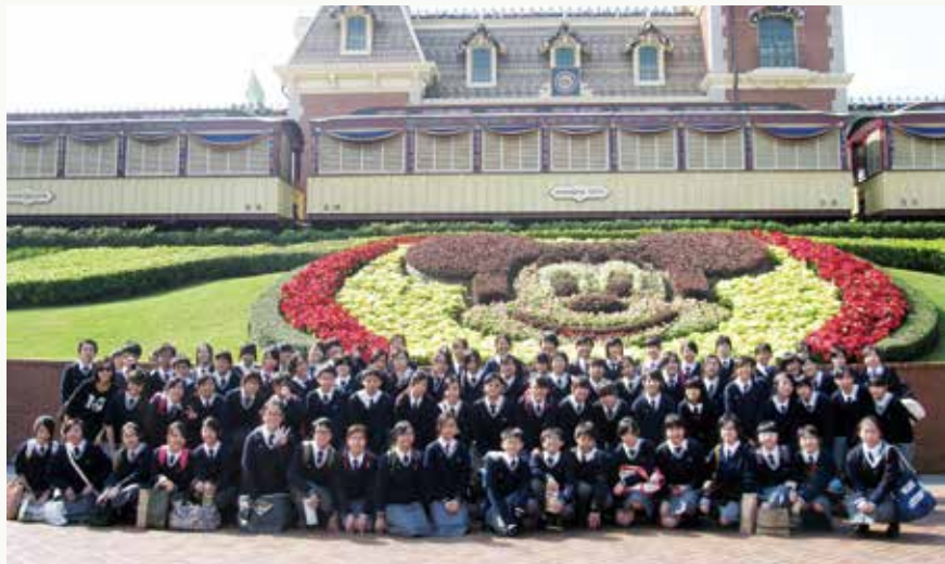
Disney Performing Arts 於迪士尼表演