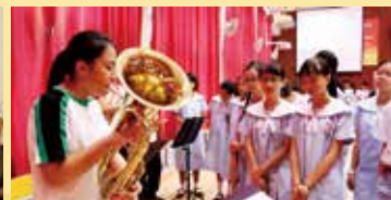
Members of the Wind Band introducing different musical instruments to S1 students. 管樂團成員向中一同學介紹不同的樂器。