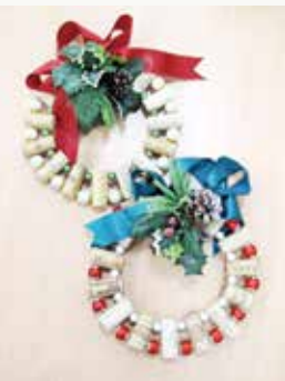
The staff of Swire Properties Ltd participated in the Christmas wreath D.I.Y. workshop. 太古地產有限公司的員工參與本校舉辦的「聖誕花環工作坊」。