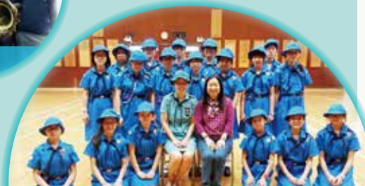
Girl Guides 女童軍