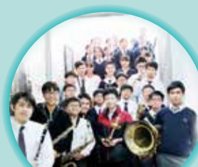
Wind Band 管樂團