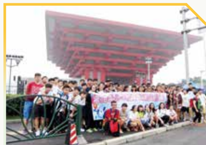
Shanghai P.E. Camp 上海體育營