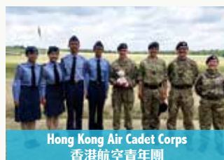
Hong Kong Air Cadet Corps 香港航空青年團