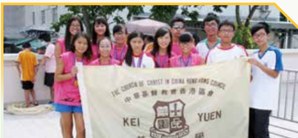
Our swimming team had a great success in the inter-school competition. 學校泳隊於校際比賽表現出色。