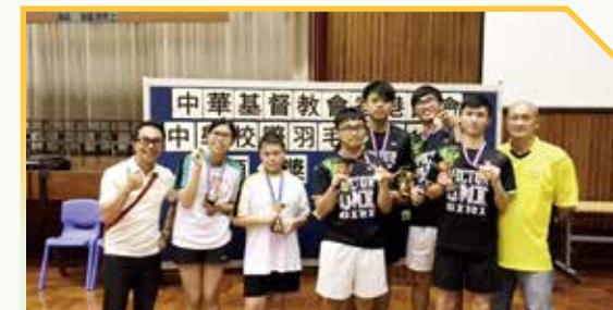
Our Badminton Team members always perform well in the CCC Joint Schools Badminton Competition and get many prizes. 羽毛球隊成員表現出色，經常在區會校際羽毛球賽中獲得多個獎項。