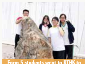
Form 5 students went to RTHK to make recording for Teen Time Open Space on 19 November 2018.