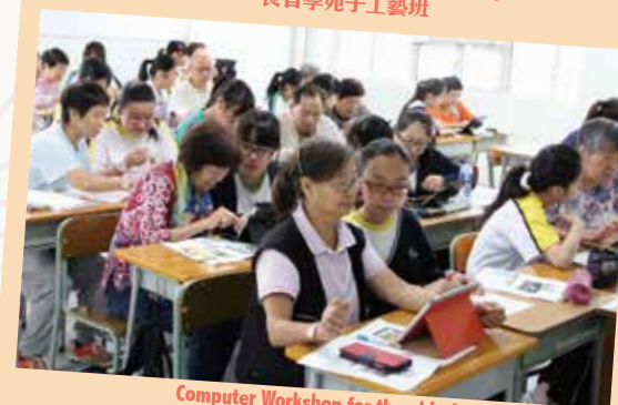
Computer Workshop for the elderly 長者學苑電腦班