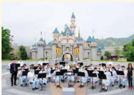
Disney Performing Arts 於迪士尼表演