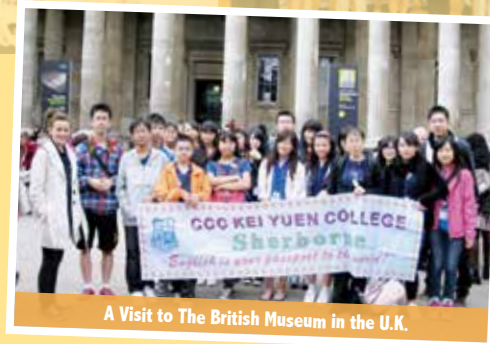
A Visit to The British Museum in the U.K.

英 語是國際語言，是學生升學及就業不可或缺的基石。為裝備學生，迎接未來的挑戰，本校特加強英語教學。由 2010 / 2011 年度開始，本校中一所有班別均使用英語為教學語言，本學年， 初中年級使用英語授課的科目共有 14 科 ，包括：英文、數學、地理、綜合科學、物理、化學、生物、電腦、歷史、視覺藝術、體育、家政、音樂及設計與科技。