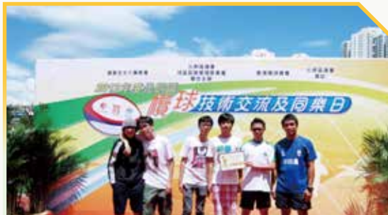
Rugby Fun Day 橄欖球技術交流同樂日