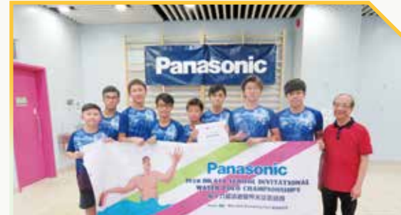
Our Water Polo Team members won the fifth place in the Panasonic 19 th HKASA School Invitational Water Polo Championship on 11 th November, 2018. 水球隊成員於 Panasonic 第十九屆泳總學界水球邀請賽奪得第五名。