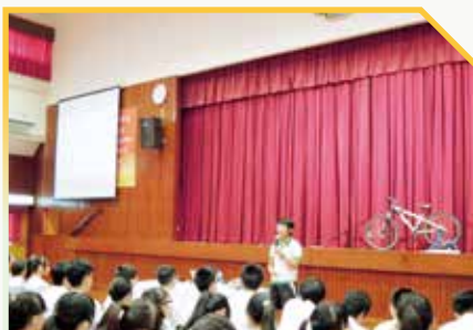
Cycling Talk 單車專題講座