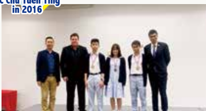
Form 5 Team came third in the Debating Competition 2019 held by HKPTU