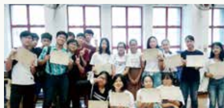
CCC English Camp Participants at CCC English Summer Camp, ELIC 2019