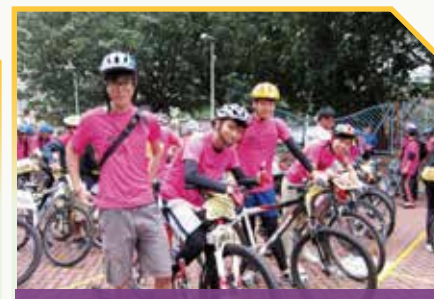
The Opening Ceremony of the Yuen Long Bike City Orienteering Competition. 元朗單車定向比賽開幕禮