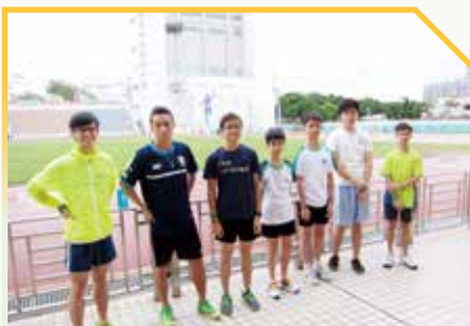
"Run Our City" Training 「全城街馬」訓練