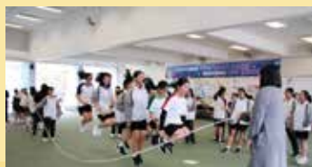
S.1 Rope Skipping 中一級跳繩活動