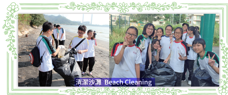
清潔沙灘 Beach Cleaning