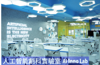
人工智能創科實驗室 AI Inno Lab