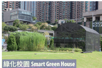
綠化校園 Smart Green House