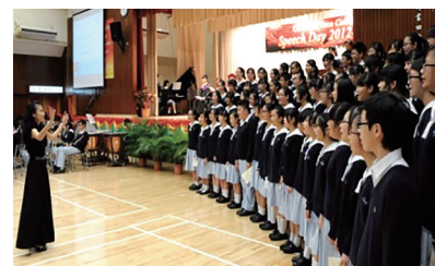
Choir Performance on Speech Day 合唱團於畢業禮表演