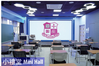
小禮堂 Mini Hall