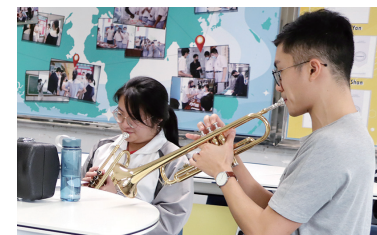
Instrument Class 樂器班