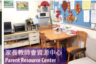
家長教師會資源中心 Parent Resource Center