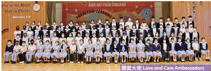
關愛大使 Love and Care Ambassadors