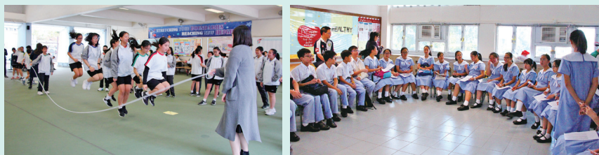
中一級跳繩活動 S.1 Rope Skipping

關注社交發展：暑假期間舉辦中一暑期銜接課程，由領袖生及「大哥哥大姐姐計劃」的學生領袖帶領活動，讓新生互相認識，從而建立友誼。並於開學後舉辦午間分享環節，由「大哥哥大姐姐」與中一同學分享及交流生活感受。