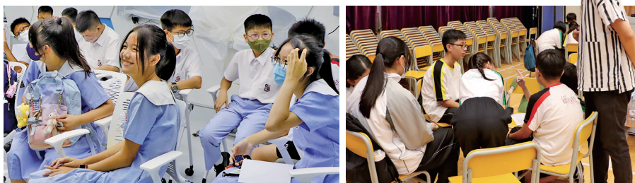
中一同學參加團隊建立活動。

踏入中學校園，中一新生面對陌生的學習環境難免感到徬徨不安。為了讓學生更易融入校園新生活，本校特別安排以下的配套措施，支援中一新生。