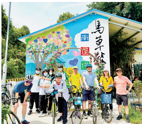
Students, teachers and parents enjoyed a bike tour to Ma Tso Lung. It was organized by the cycling club.