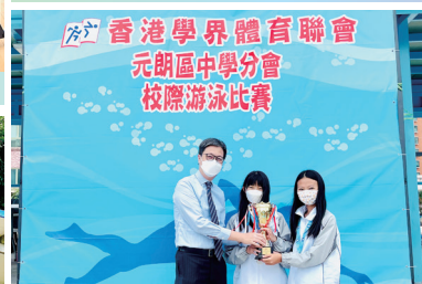
Our swimming team won the Second Runner-Up in Overall Girls C Grade in the Yuen Long Inter-school Swimming Championships.

本校重視擴闊學生的視野及學習經驗，除傳統體育課程外，亦鼓勵學生參與不同的體育比賽及活動。