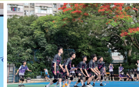
Our dodgeball team joined the 2023 Hong Kong Inter-Secondary School (Single-Ball Style) Dodgeball Championship