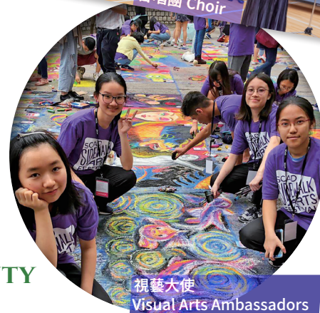
視藝大使 Visual Arts Ambassadors