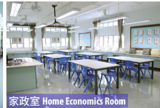
家政室 Home Economics Room