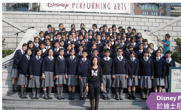
Disney Performing Arts 於迪士尼表演