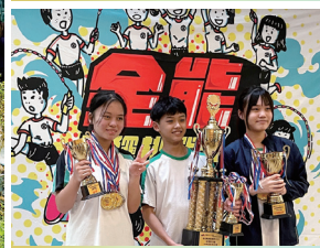
Our skipping won many prizes in the competition held by Masterful Studio