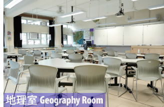
地理室 Geography Room