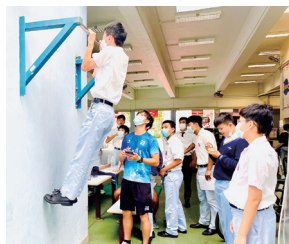
KYC King of Muscle Competition