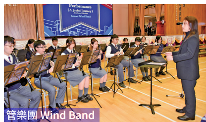
管樂團 Wind Band

學生會幹事、社幹事、班會幹事、課外活動學會幹事、KYL、領袖生、大哥哥大姐姐、升學就業領袖生、環保大使、關愛大使、英語大使、視藝大使、長者學苑導師等。