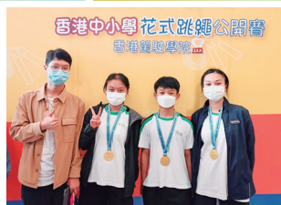
Our skipping team always won many prizes.