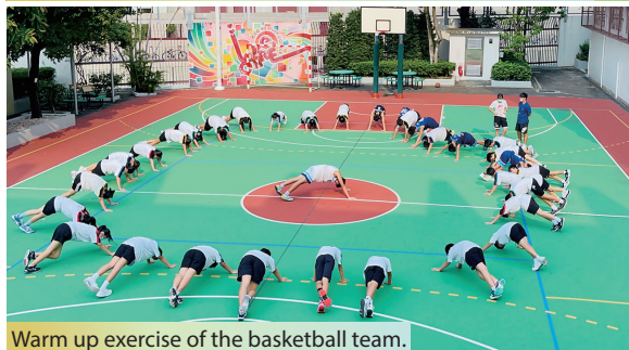
Warm up exercise of the basketball team.