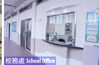
校務處 School Office