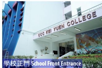
學校正門 School Front Entrance