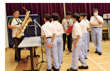
S.1 Orientation Day Windband Activity 中一迎新日管樂團活動