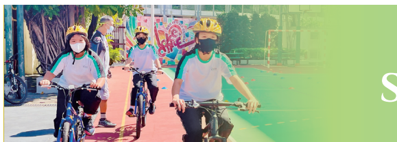
Cycling became the main curriculum in form one PE lessons.