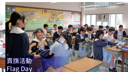
賣旗活動 Flag Day