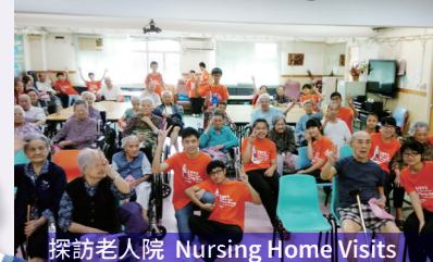
探訪老人院 Nursing Home Visits