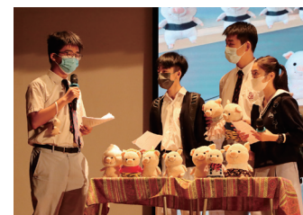
S.3 TV Commercial Competition

再者，本校著重多元學習經歷，為學生提供不同類型的英語學習活動，如英國、澳洲英語遊學團、加拿大英語學習文化交流營、美國英語學會英文暑期課程、英語話劇比賽及英語空中廣播等，以提升學生的英語能力，拓展國際視野。