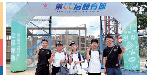
Our softball team joined the 66 th Festival of Sports.