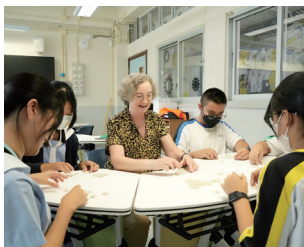
English Speaking Day