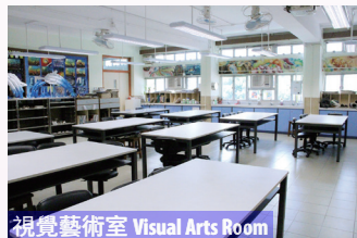
視覺藝術室 Visual Arts Room

The school possesses facilities such as Two standard basketball courts, a Multi-Functional Mini Hall, An English Resource Room, an AI Innovation Lab, a Computer Room, a Library Information Corner, a SRL Lab, a School History Corridor, Solar Energy Generation Systems, Smart Green House, a Parent Resource Centre, lockers for each student. Also, air conditioners, a smart TV, an Apple TV and an intranet system are installed in all classrooms, special rooms and the school hall. The school's wireless network covers the entirety of the campus.