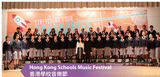
Hong Kong Schools Music Festival 香港學校音樂節