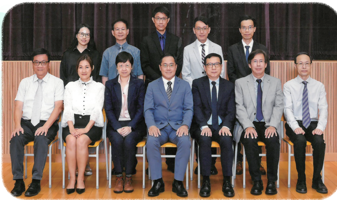
校政委員會 Administrative Committee of the School