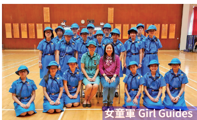
女童軍 Girl Guides