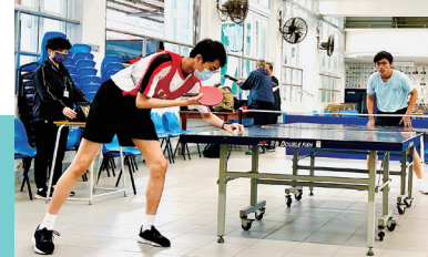
Our table tennis team won the second runner-up in Boys A grade and third runner-up in Boys C grade in the Yuen Long Inter-school table tennis championships.