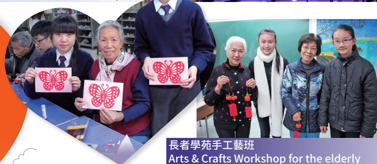
長者學苑手工藝班 Arts & Crafts Workshop for the elderly