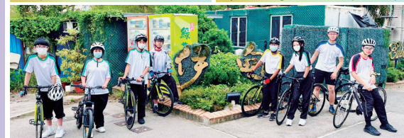
A bike tour from Fanling to Yuen Long was held by the cycling club.