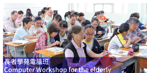
長者學苑電腦班 Computer Workshop for the elderly