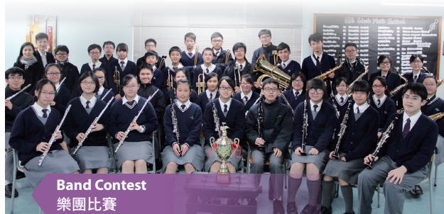
Band Contest 樂團比賽