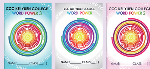
英文生字自學手冊 English Vocabulary Handbook

照顧學生的英語學習：編印各科英文生字自學手冊，供學生參考。開辦暑假銜接課程、中一學習策略／學習技巧工作坊、中一英文口語班（外籍英語教師教授）、中一資優／拔尖／補底課程等，並推行周六英文、數學提升計劃，協助學生面對不同的學習需要。