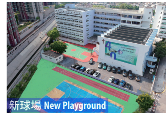
新球場 New Playground