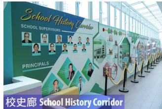
校史廊 School History Corridor