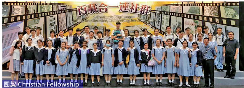
團契 Christian Fellowship