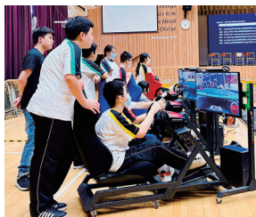
Students enjoyed STEM in P.E.